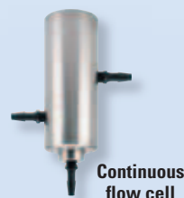
Continuous flow cell

Visit ColeParmer.com for more processing accessories including microtips, extenders, boosters, cooling cells, and cup horns.